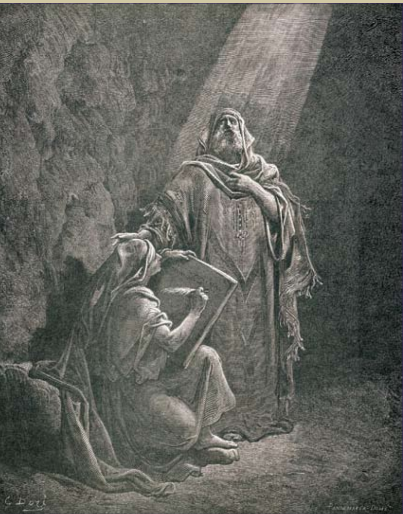
Jeremiah, by Gustave Doré

Failure to recognize the exclusiveness of the covenant relationship, or covenant breaking, invoked curses upon the house of Israel as shown in this passage: “You only have I known [i.e., chosen to make covenants with] of all the families of the earth: therefore I will punish you for all your iniq-