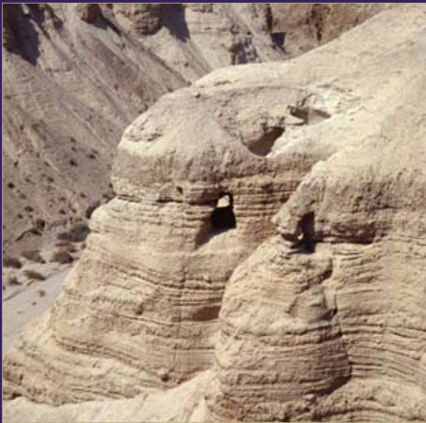
Qumran Cave 4, where fragmentary copies of documents were found that governed the covenant lives of Essenes, a group contemporary with Jesus.

In answer to Hezekiah’s pleas, God sent “the angel of the Lord” who “smote in the camp of the Assyrians an hundred fourscore and five thousand: